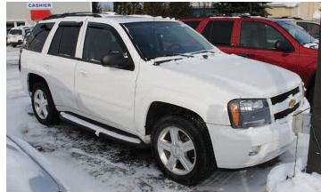
2008 CHEVY TRAILBLAZER LT 4WD, sunroof, tow pkg, leather, loaded. Only 75 K. AS LOW AS $199 A MONTH