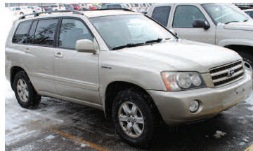
2002 TOYOTA HIGHLANDER. 4x4, 109 K, 3.0L V-6, 4 door, leather. SALE $10,995. AS LOW AS $249 A MONTH.