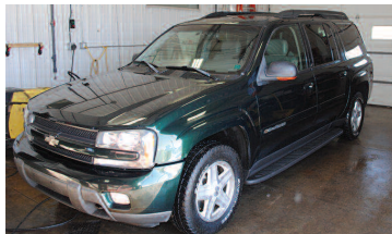
2003 CHEVY TRAILBLAZER EXT 4WD, leather, 6 cyl, 3rd row seating, tow pkg. Only 90 K miles. AS LOW AS $199 A MONTH