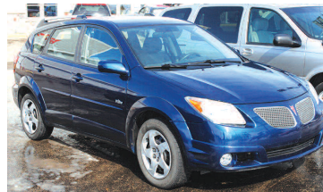
2005 PONTIAC VIBE Air, cruise, lots of cargo room. Only 59 K. AS LOW AS $179 A MONTH