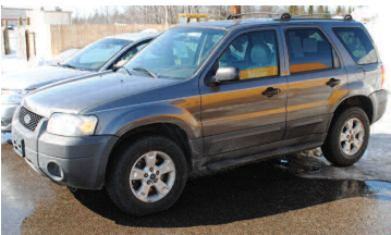
2005 FORD ESCAPE AWD, leather, moonroof, loaded. AS LOW AS $199 A MONTH