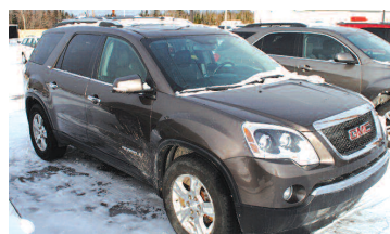
2008 GMC ACADIA SLT-1 AWD, heated, leather seats. AS LOW AS $219 A MONTH