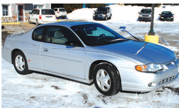
2004 CHEVY MONTE CARLO SS 2 door coupe, V-6. AS LOW AS $149 A MONTH