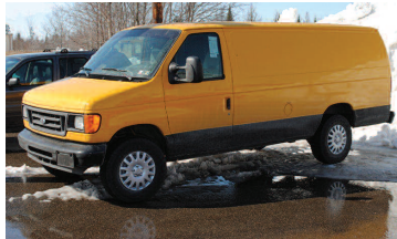
2007 FORD ECONOLINE CARGO VAN E-150, extended. AS LOW AS $199 A MONTH