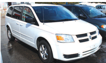
2009 DODGE GRAND CARAVAN Stow-N-Go, 3rd row seat. AS LOW AS $199 A MONTH