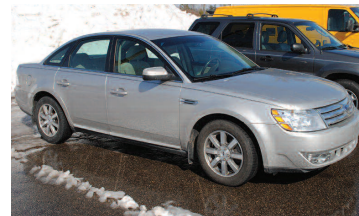
2008 FORD TAURUS V-6, very nice. AS LOW AS $199 A MONTH