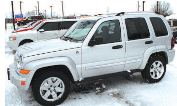
2006 JEEP LIBERTY LIMITED 4x4, power sunroof, 3.7L. AS LOW AS $199 A MONTH