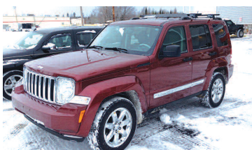
2008 JEEP LIBERTY LIMITED 4x4, leather, sunroof, tow pkg, nice AS LOW AS $199 A MONTH