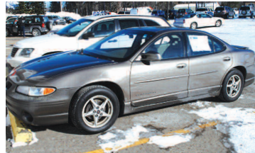
2006 PONTIAC GRAND PRIX GT V-6, traction control, 29 MPG. AS LOW AS $199 A MONTH