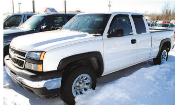
2006 CHEVY SILVERADO 1500 LT3 Ext cab, 4x4, bedliner tow pkg. AS LOW AS $199 A MONTH