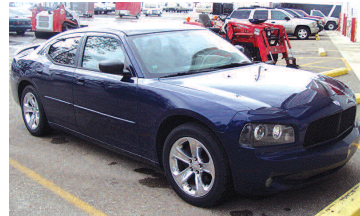
2006 DODGE CHARGER SXT This is a NICE Ride. AS LOW AS $199 A MONTH