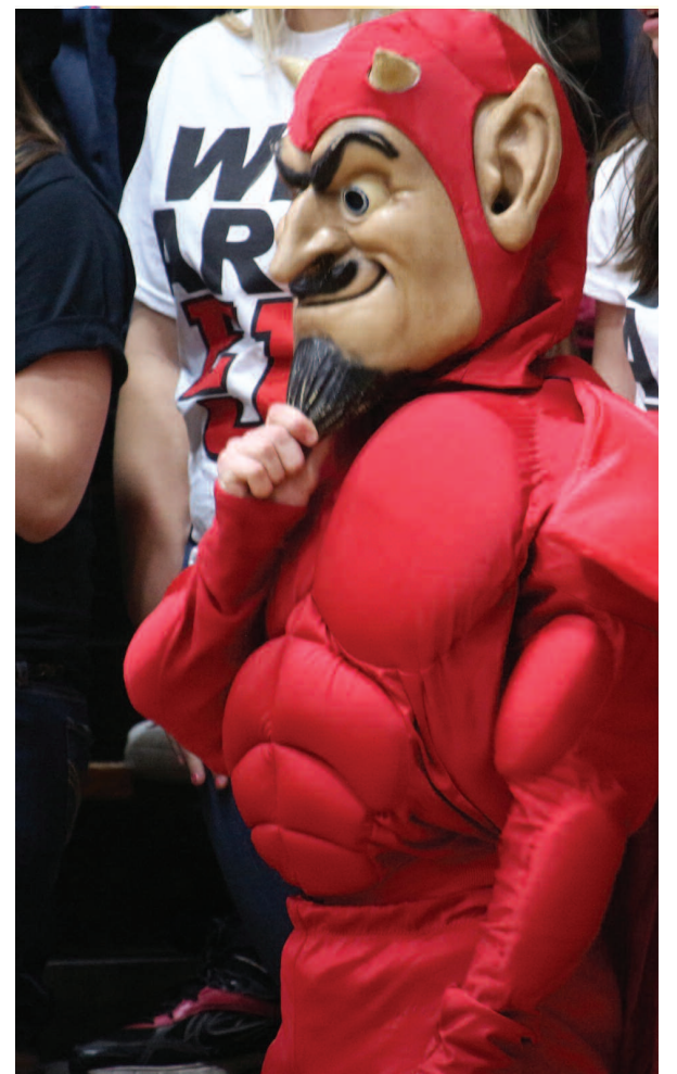
ABOVE: The East Jordan Red Devil thinks of a game plan to fire up the already excited East Jordan Crowd.