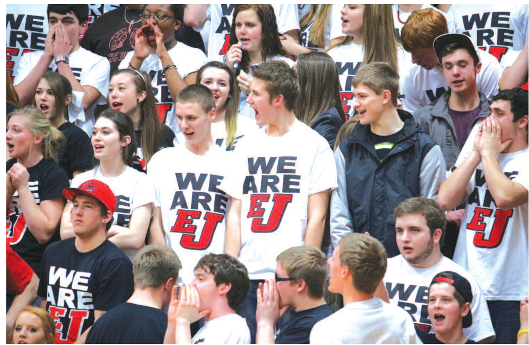
ABOVE: The success of the East Jordan basketball team has the entire student body and community supporting them as they show in dressed in Red, Black and White.