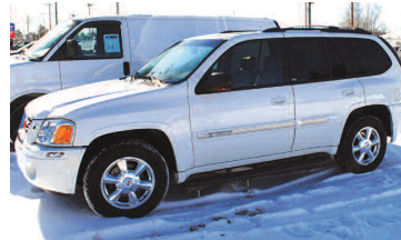
2003 GMC ENVOY SLT 4WD, leather, power moonroof, tow pkg. AS LOW AS $199 A MONTH