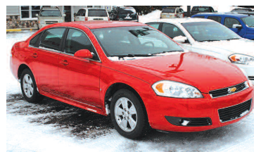
2010 CHEVY IMPALA LT Loaded, 29 MPG, very nice. AS LOW AS $189 A MONTH