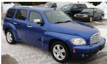
2006 CHEVY HHR LT 30 MPG, air, cruise, lots of cargo room and seats 5. AS LOW AS $179 A MONTH.