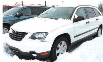
2005 CHRYSLER PACIFICA AWD, only 99 K. AS LOW AS $179 A MONTH