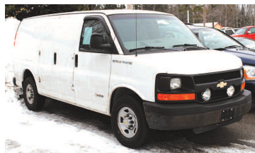
2005 CHEVY EXPRESS CARGO VAN Only 91 K, storage bins. AS LOW AS $199 A MONTH